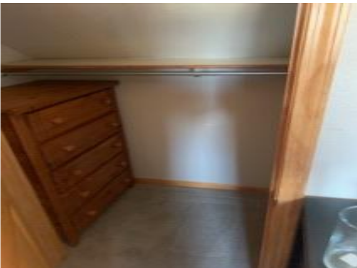
Bedroom One Closet