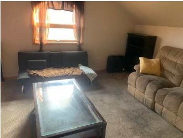
Apartment Living Room