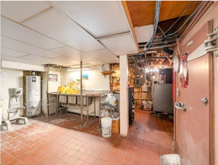
Lower Level Prep Kitchen with Walk In