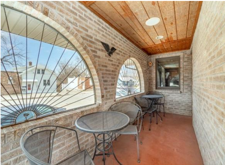
Indoor / Outdoor Patio