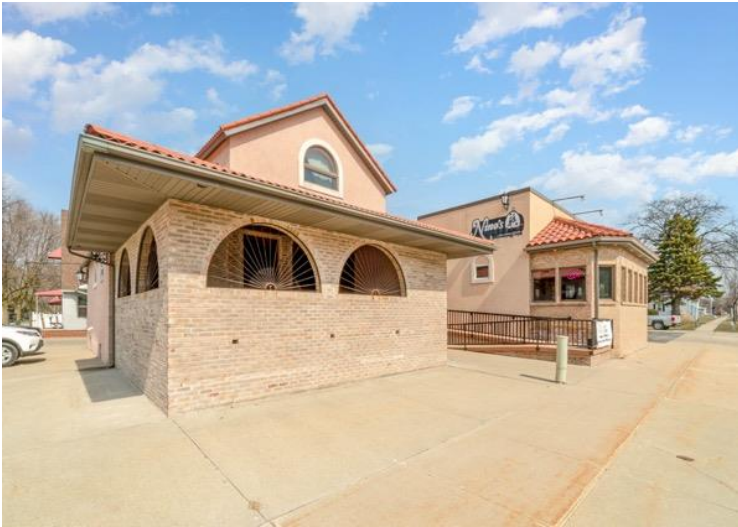
Building Front View